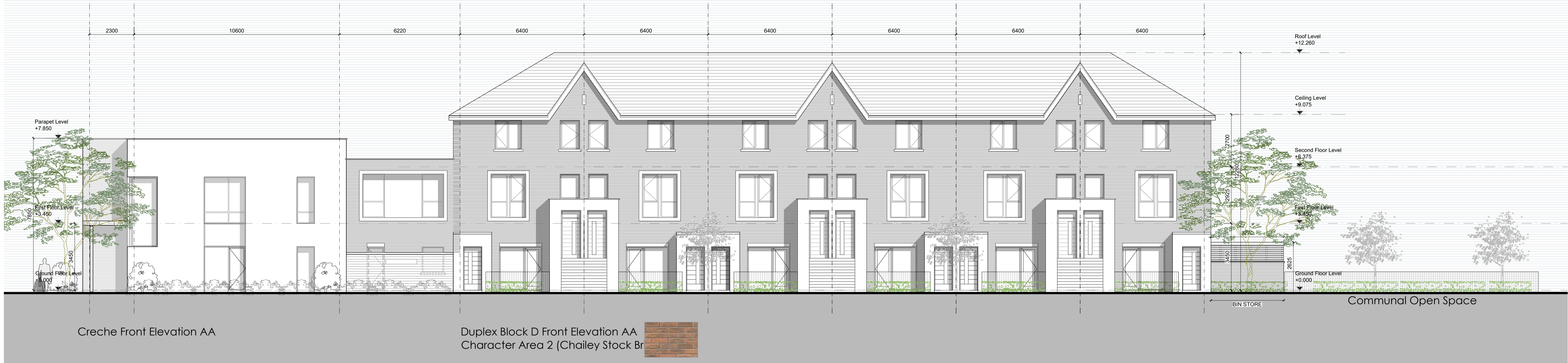
Creche Front Elevation AA