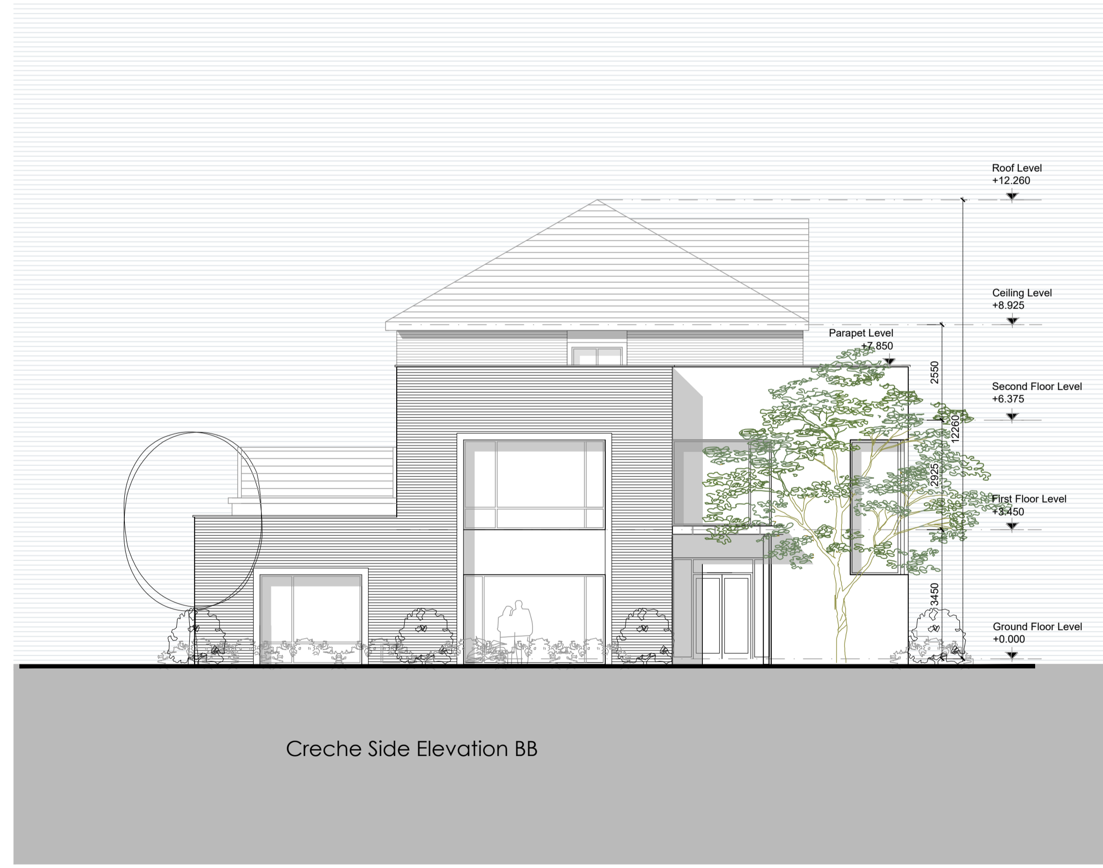
Creche Side Elevation BB