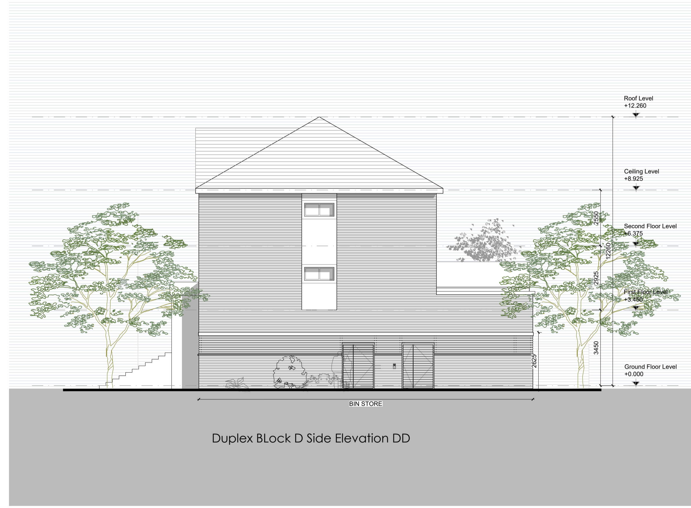
Duplex Block D Side Elevation DD